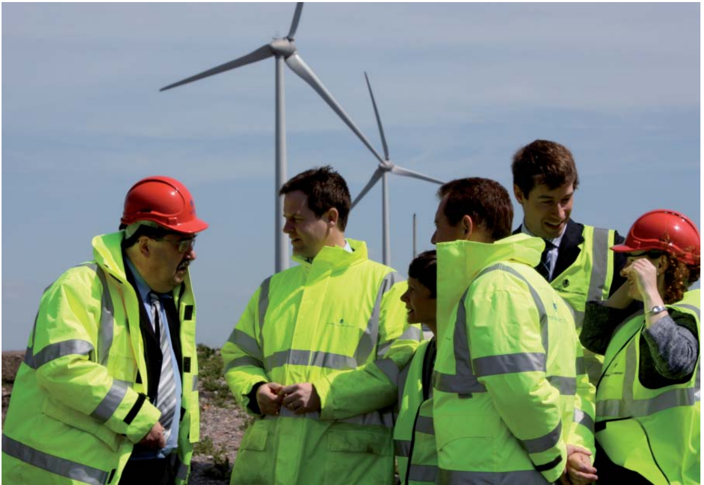
Lib Dems' leader Nick Clegg MP visits a wind farm; his manifesto promises £400m to convert shipyards to build offshore turbines

Former Sustainable Development Commission chairman Jonathan Porritt, campaigning for the Green Party, says one reason the main parties said so little on green issues in the campaign's first fortnight is because they now have so much in common.