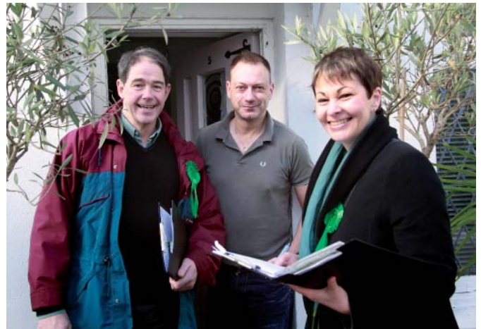
Greens’ leader Caroline Lucas and Jonathon Porritt campaigning

Like Labour, the Liberal Democrats see 40% of UK electricity coming from low-carbon energy sources by 2020. But their manifesto rules out any new nuclear power stations. And new coal-fired power stations will only be allowed “if accompanied by the highest level of carbon capture and storage” covering all, rather than part, of their CO 2 emissions.